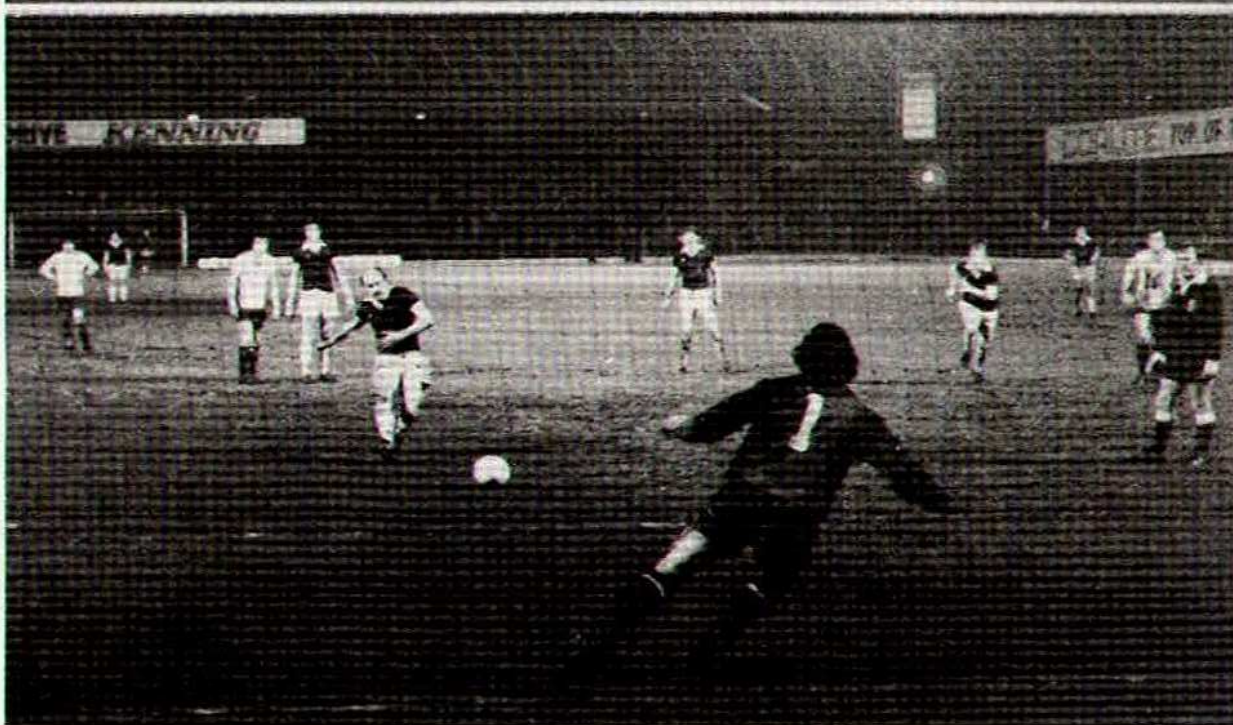
Rodney Fern completed the scoring with an 85th minute penalty (below) after Rick Green had been fouled.